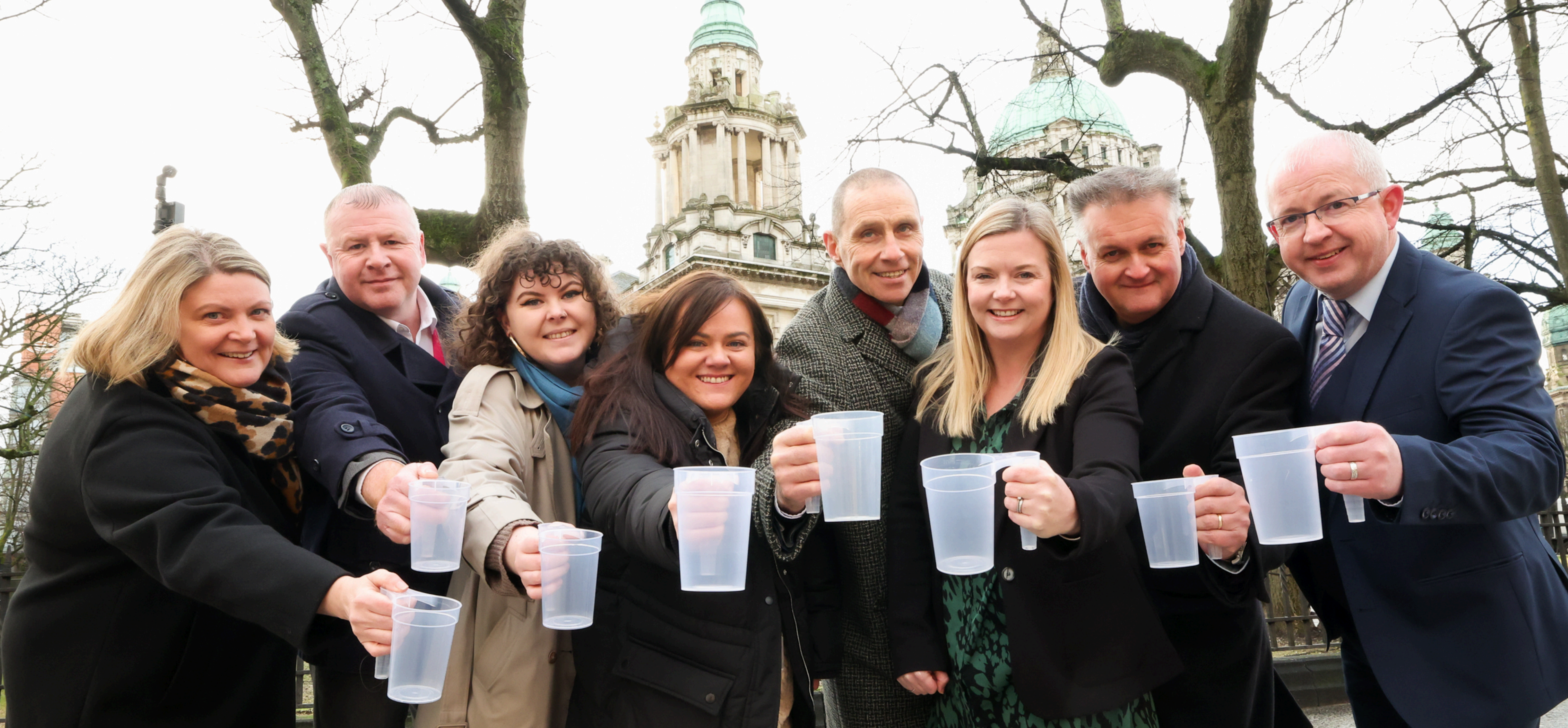
Belfast Reusable Cup Launch - UK & Ireland first multi-venue pilot 2million single use plastic cups annually / 40 tons plastic waste